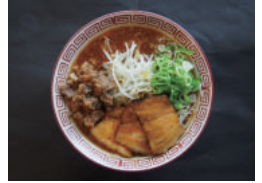
Beef Tendon Ramen 950yen