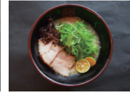
Yuzu Ramen 950yen Ramen with citrus tones and ultra-fine noodles