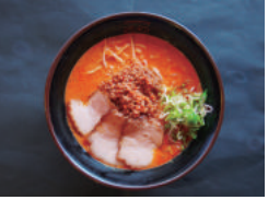
Tantanmen 950yen (spicy Szechuan style ramen) A little spicy but very nice