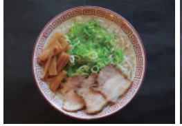
Seabura Shoyu Ramen 750yen A ramen unique to Kyoto