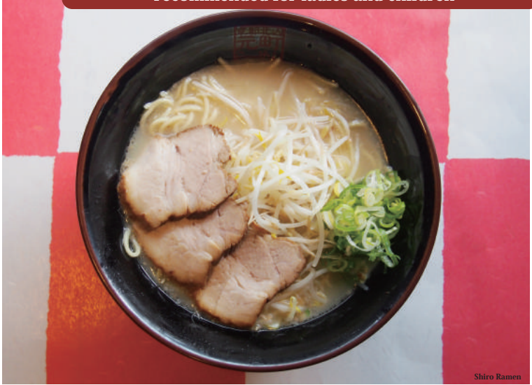
Shiro(white) Ramen 750yen Shiro(white) Chashyu Pork Ramen 950yen