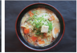
Shiro Vegetable Ramen 950yen Shiro Ramen topped with a variety of vegetables; a dab of butter makes it even more delicious. Provides half the daily recommended requirement for vegetables.

Topping Raw egg: +50 yen Seasoned egg: +100 yen OMORI (larger serving): +100 yen Substitute for ultra-fine noodles: free