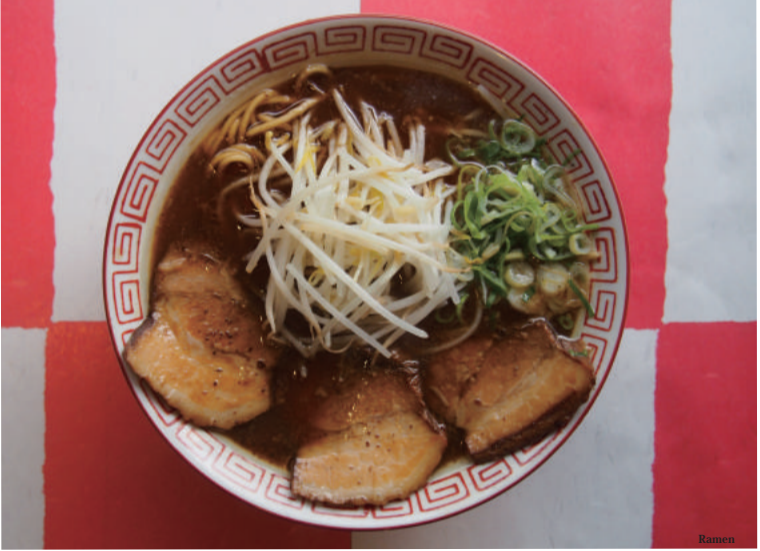
Ramen 750yen Chashyu Pork Ramen 950yen