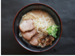
Beef Tendon Shiro (white) Ramen 950yen